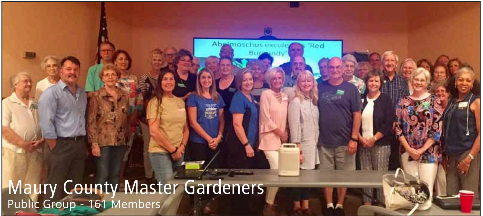
Maury County Master Gardeners Public Group - 161 Members

Maury County Master Gardeners has a Facebook page!