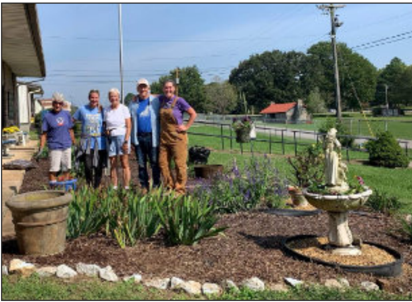
Senior Citizen's Center October Service Project Lookin' Good! Thanks guys and gals!