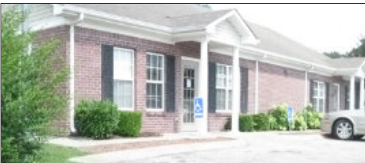
Maury County Family Center Helping provide, plant, repair & maintain landscape SEE DETAILS HERE