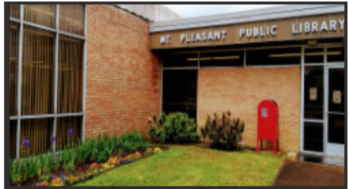
Mount Pleasant Public Library Landscape Maintenance