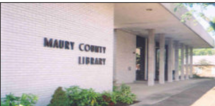
Maury County Public Library Design, Plant and Maintain Landscape SEE DETAILS HERE