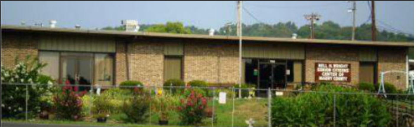
Maury County Senior Citizen's Center Landscape Maintenance