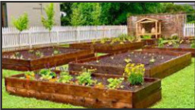
Polk Home Kitchen Gardens Planting & Maintenance