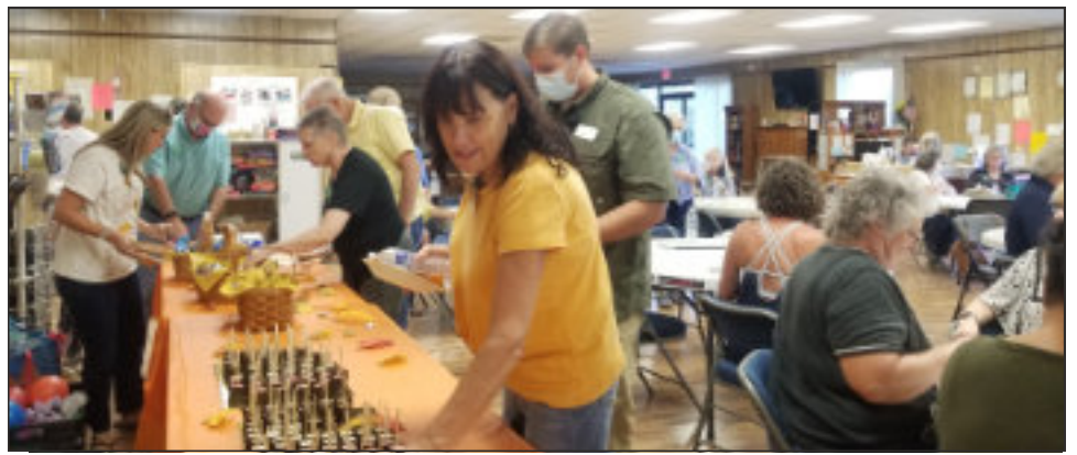
Food and Sharing With Friends, Old and New