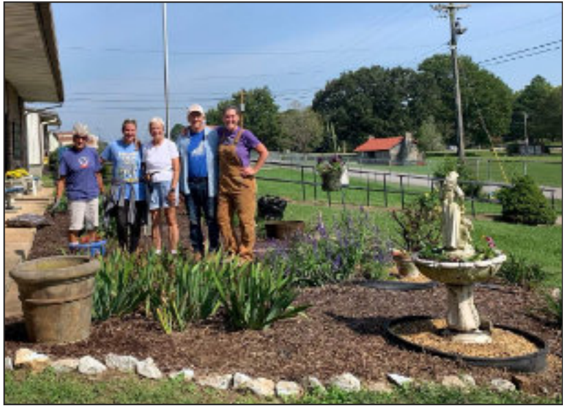
Senior Citizen's Center October Service Project Lookin' Good! Thanks guys and gals!