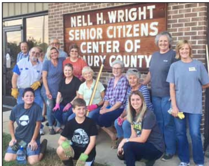
Trimming the crepe myrtles, pulling weeds, digging iris bulbs from under the bushes, and general clean up at the Senior Citizens Center.