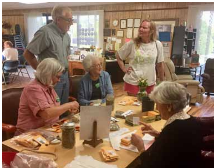
Filling and labeling seed packets to be given away as promotional materials at MCMG booths beginning in the spring of 2019.