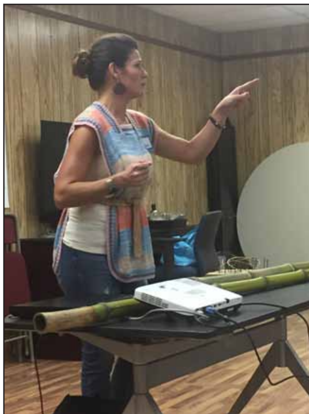
Crystal Blackburn Bamboo