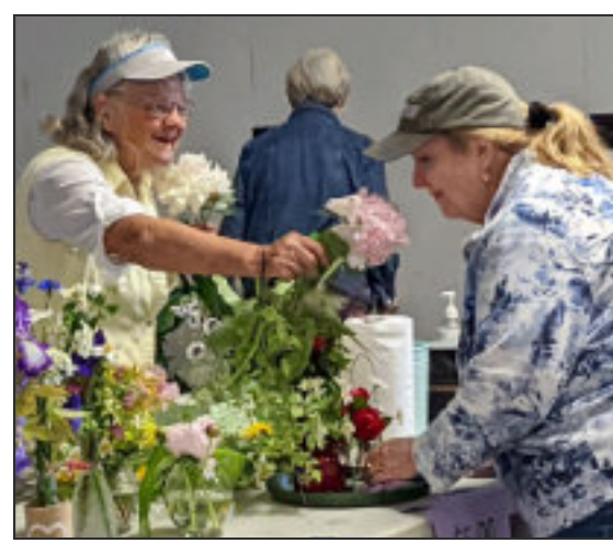
MCMG Plant Sale May 7, 2022