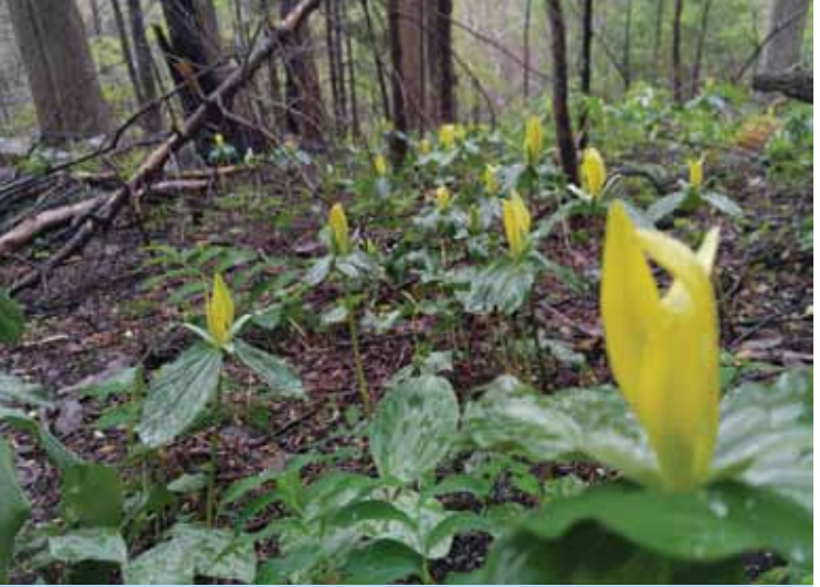
June 27th in Gallatin

Central region- hosted by Sumner County at Vol State Comm. College