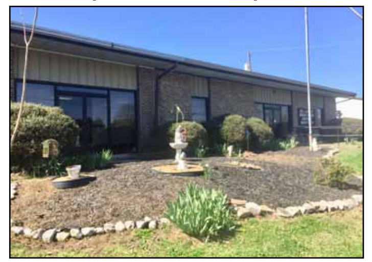
A Good Start! Let's continue cleaning the landscape for the Maury County Senior Citizen's Center

Begins 4:30 pm Landscaping at Sr. Citizen's Center 6 pm: Potluck - Business Bits - Speaker